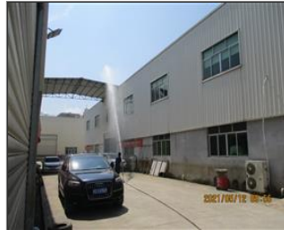
Photo of fire safety equipment Fire hydrant testing.JPG