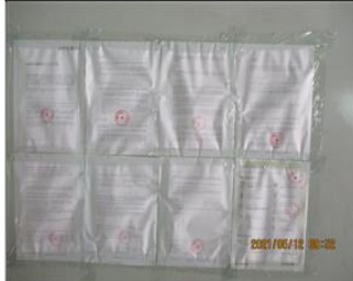
Photo of the code of conduct on display COC posted.JPG