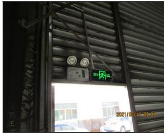
Photo of fire safety equipment Emergency lighting and exit.JPG