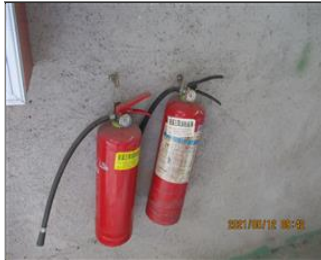
Photo of fire safety equipment Fire extinguishers.JPG