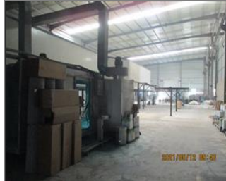
Photo of the inside of the main production hall Painting.JPG