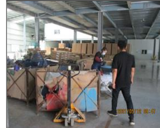
Photo of the inside of the main production hall Polishing.JPG