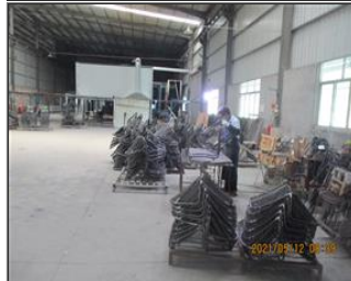
Photo of the inside of the main production hall Welding.JPG