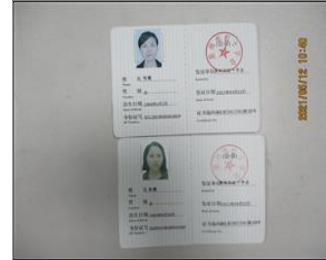
Photo first aid facilities First aidor certificate.JPG