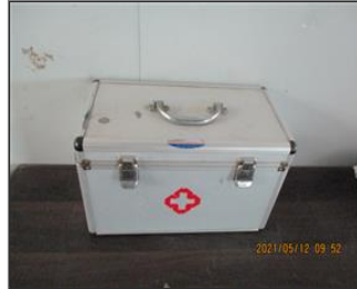
Photo first aid facilities First aidor box.JPG