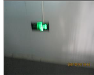
Photo of fire safety equipment Evacation signs.JPG