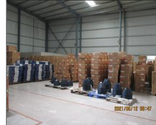
Photo of the inside of the main production hall Finished goods warehouse.JPG