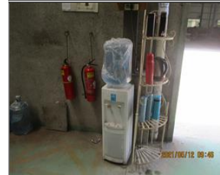
Photo of the sanitary facilities Drinking water.JPG