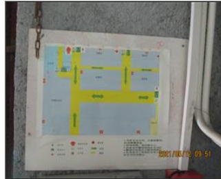
Photo of fire safety equipment Evacation map.JPG