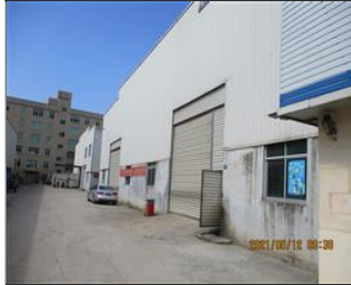
External photo(s) of the production unit(s) Factory gate.JPG