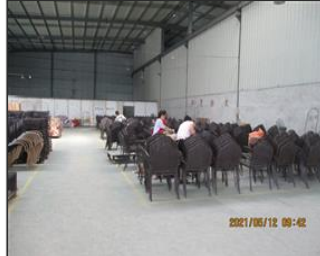
Photo of the inside of the main production hall Assembly and packing.JPG