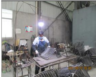
Photo of the inside of the main production hall Welding 2.JPG