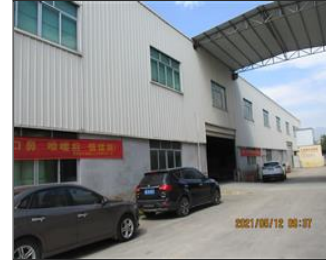
External photo(s) of the production unit(s) Production building 1.JPG