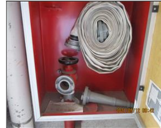
Photo of fire safety equipment Fire hydrant.JPG