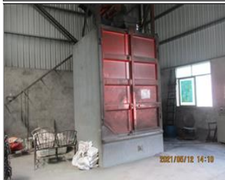
Photo of the inside of the main production hall Sand blasting.JPG