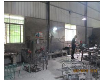
Photo of the inside of the main production hall Cutting.JPG