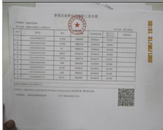
Photo of non-conformity NC insufficient social insurance participated.JPG