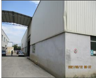
External photo(s) of the production unit(s) Production building 2.JPG