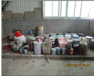
Photo of chemical storage room (if applicable) Chemical warehouse.JPG