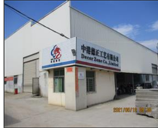
External photo(s) of the production unit(s) Factory name.JPG