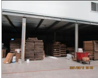
Photo of the inside of the main production hall Material warehouse.JPG